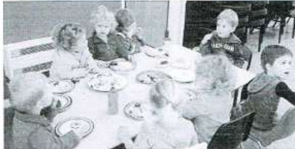
Enjoying the shared morning tea

We have had a wonderful Term Two welcoming new faces to the playgroup. It is good to see so many enthusiastic people joining the playgroup.